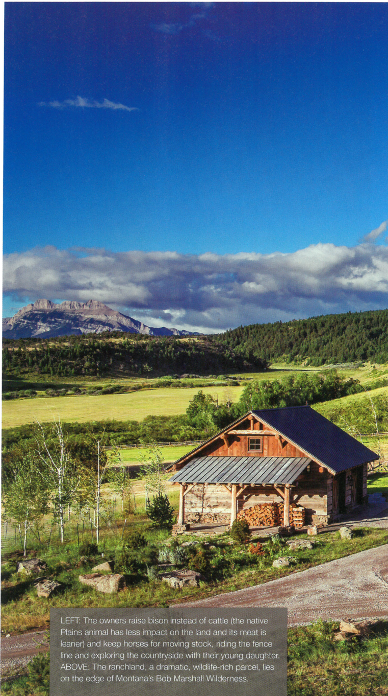
LEFT: The owners raise bison instead of cattle (the native Plains animal has less impact on the land and its meat is leaner) and keep horses for moving stock, riding the fence line and exploring the countryside with their young daughter. ABOVE: The ranchland, a dramatic, wildlife-rich parcel, lies on the edge of Montana's Bob Marshall Wilderness.