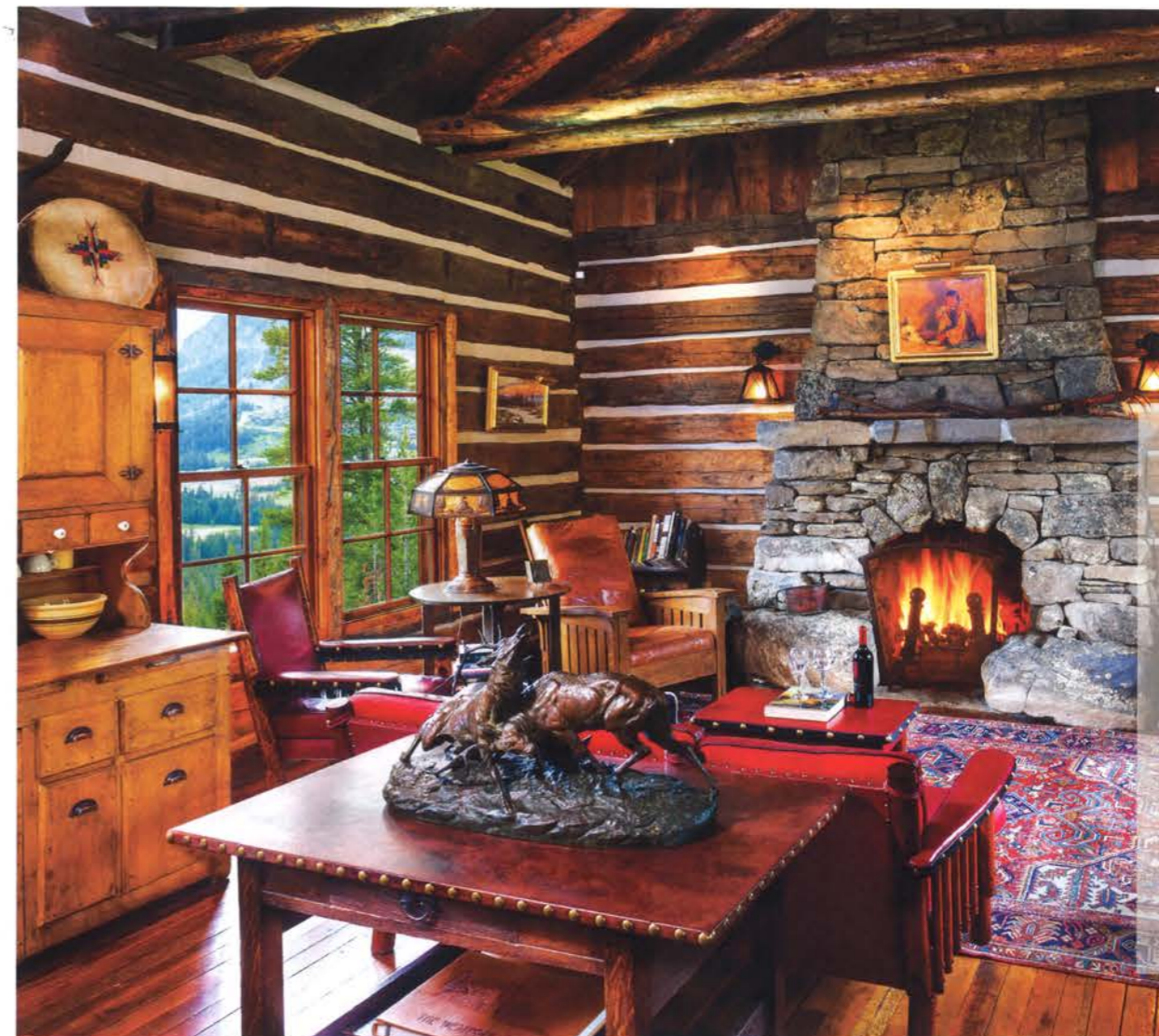
FACING PAGE: In the “dogtrot”-style cabin, the master bedroom occupies one of two old log cabins that were reassembled on the site. LEFT: In the cabin’s other log structure are the kitchen and living room, which features an antique sofa, table and chairs by Wyoming-based furniture maker Thomas C. Molesworth and, over the fireplace, an early-20th-century oil painting by Taos artist Joseph Henry Sharp. BELOW: A gentle uphill walk leads to a fire pit situated midway between the cabin and fire tower.