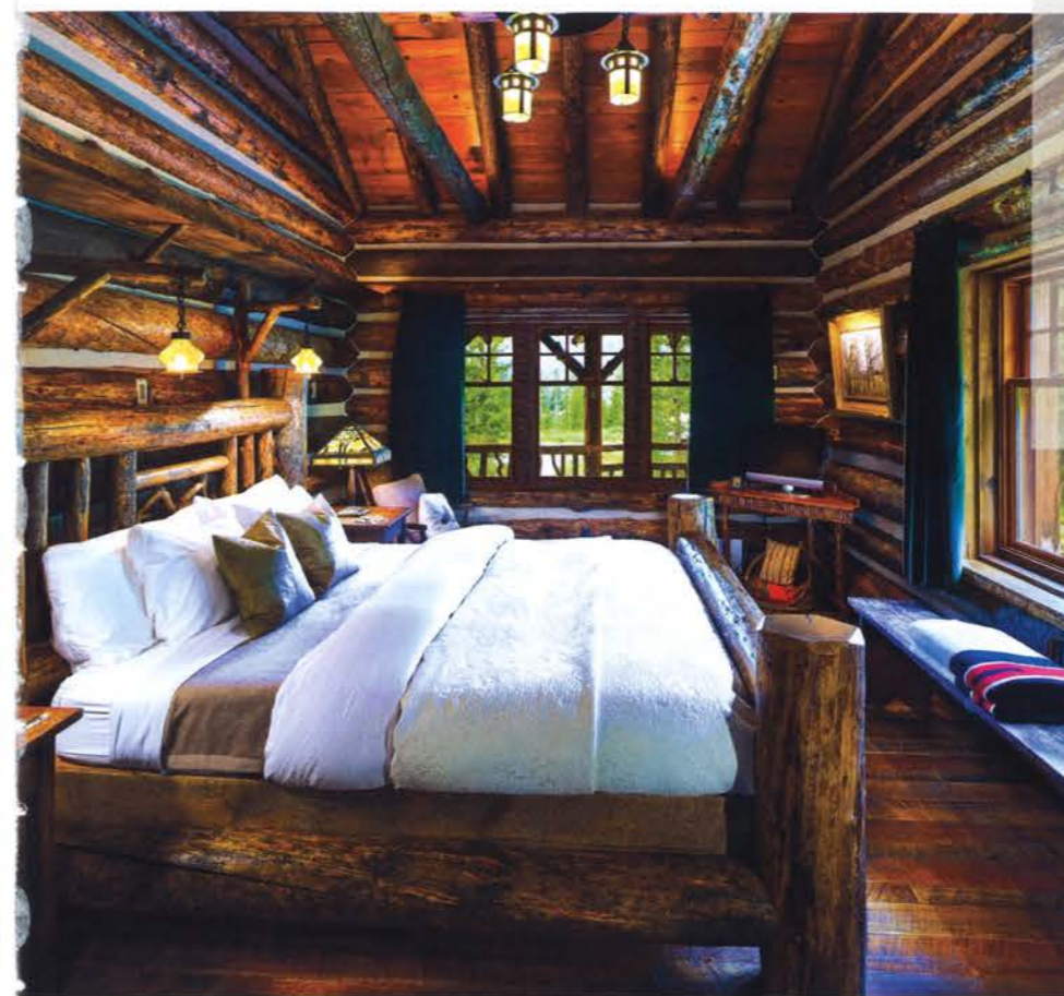
FACING PAGE: Landscaping featuring native plants surrounds the largest cabin, which has a large corner porch. THIS PAGE, TOP LEFT: The master bedroom's log-framed bed was placed to afford views westward toward the trappers' cabin and pond. BOTTOM LEFT: In the master bathroom, an antique early-20th-century English freestanding tub is complemented by a his-and-hers vanity custom-built by Yellowstone Traditions. BELOW: Like the three other main structures sharing West Fork Camp, the cabin was carefully situated to look like it has occupied its site for many decades.