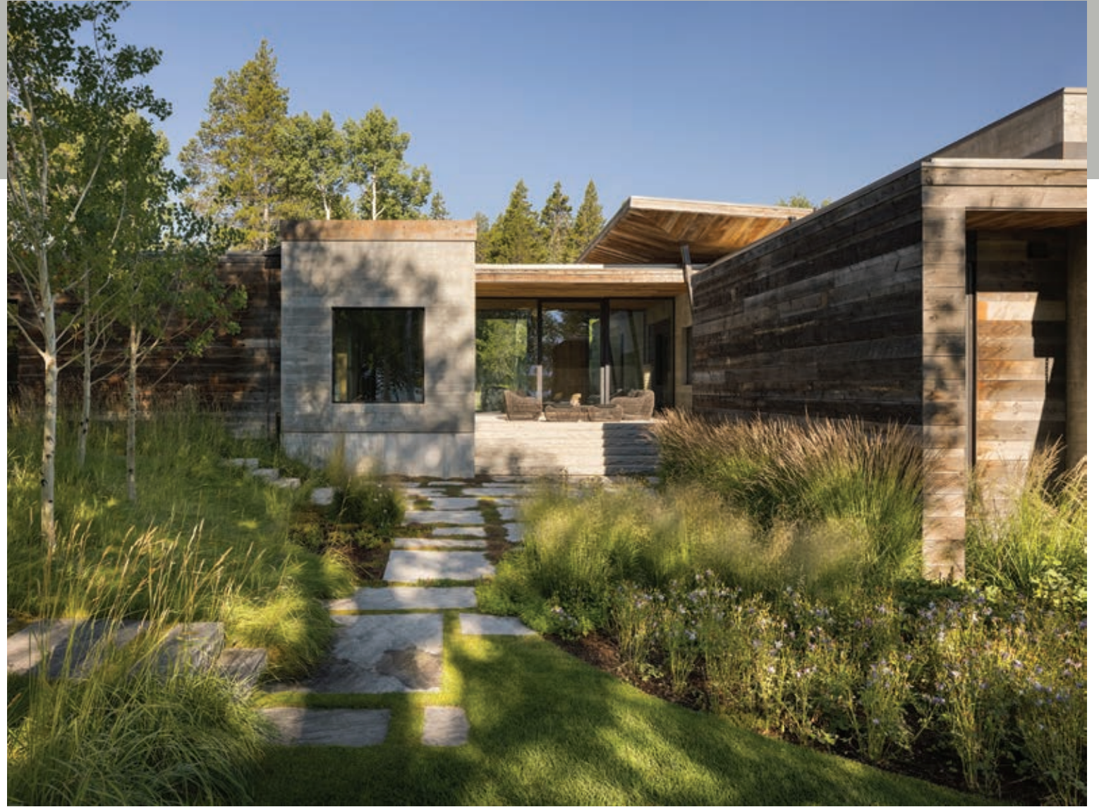
OPPOSITE PAGE: Outdoor experiences at the Moosebluff House can be enjoyed from May through the end of September. ABOVE: Energy 1 designed an efficient mechanical system for the residence, which was informed by client input, building orientation, and solar exposure. A ground-source heat pump geothermal system provides in-floor radiant heat.

The collaboration between Pearson and OSM yielded a contemporary home that respects the site and its Western environment. They did it with a material palette of natural patinated steel, limestone veneer, boards of reclaimed gray snow fence, reclaimed white oak, and board-formed concrete. “We created the roofline and board-formed concrete for a nice, solid texture and organic feel,” Barr says. “It’s a surface to build from, whether there’s a wall or transparency on the other side — with reclaimed hardwood or glazing.”